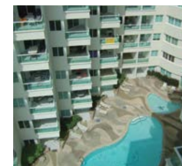
Varadero Viejo Tucacas, Venezuela