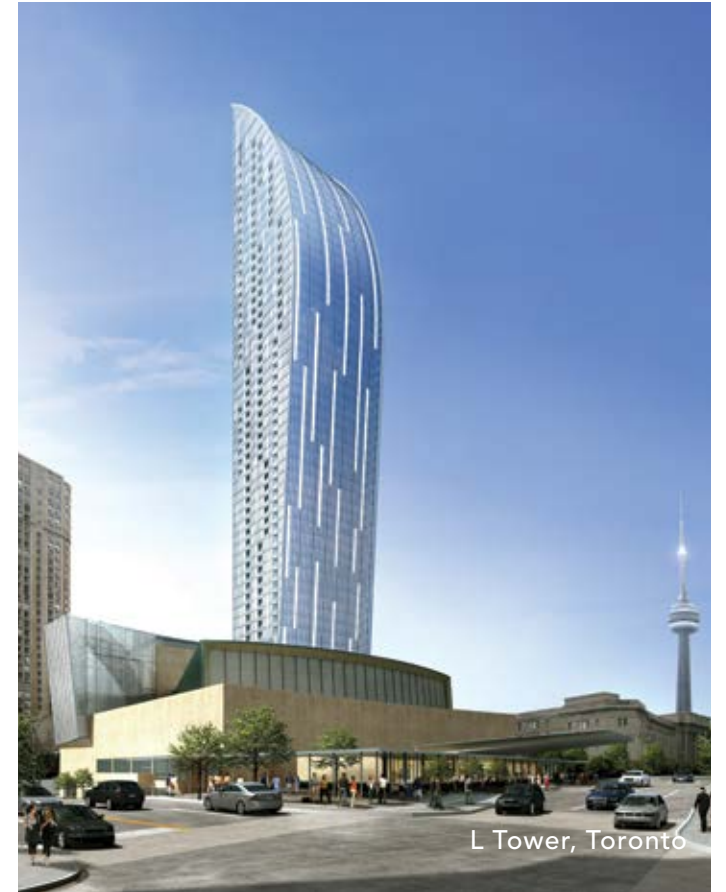
L Tower, Toronto