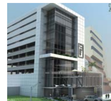
Torre F Valencia, Venezuela