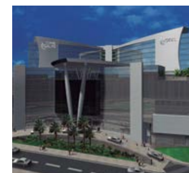
Galas Plaza Valencia, Venezuela