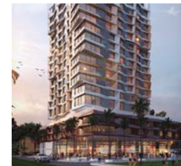
Cambria Brickell Miami, Florida