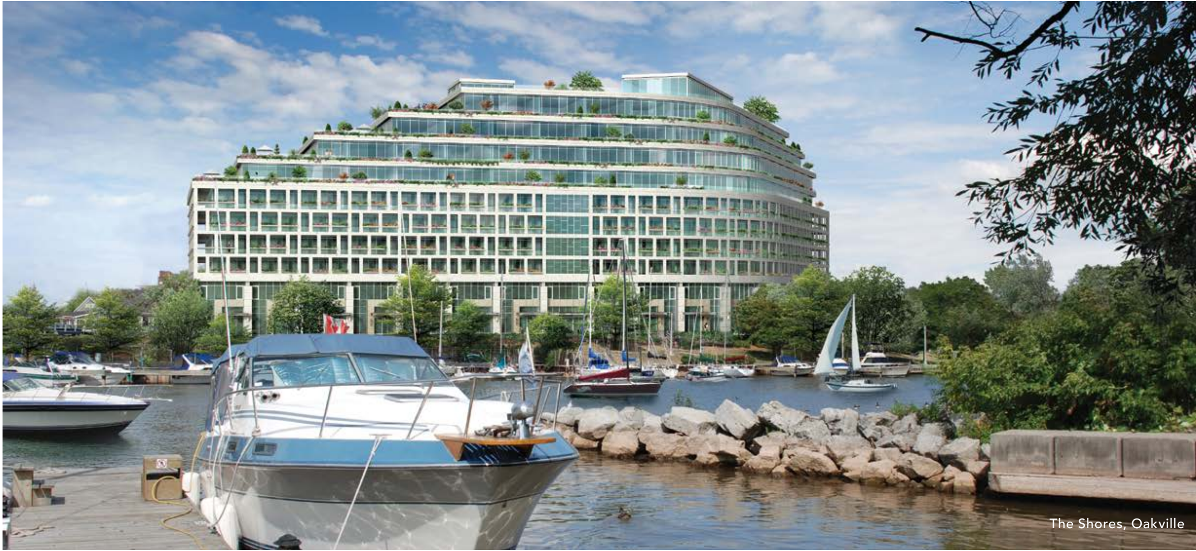
The Shores, Oakville