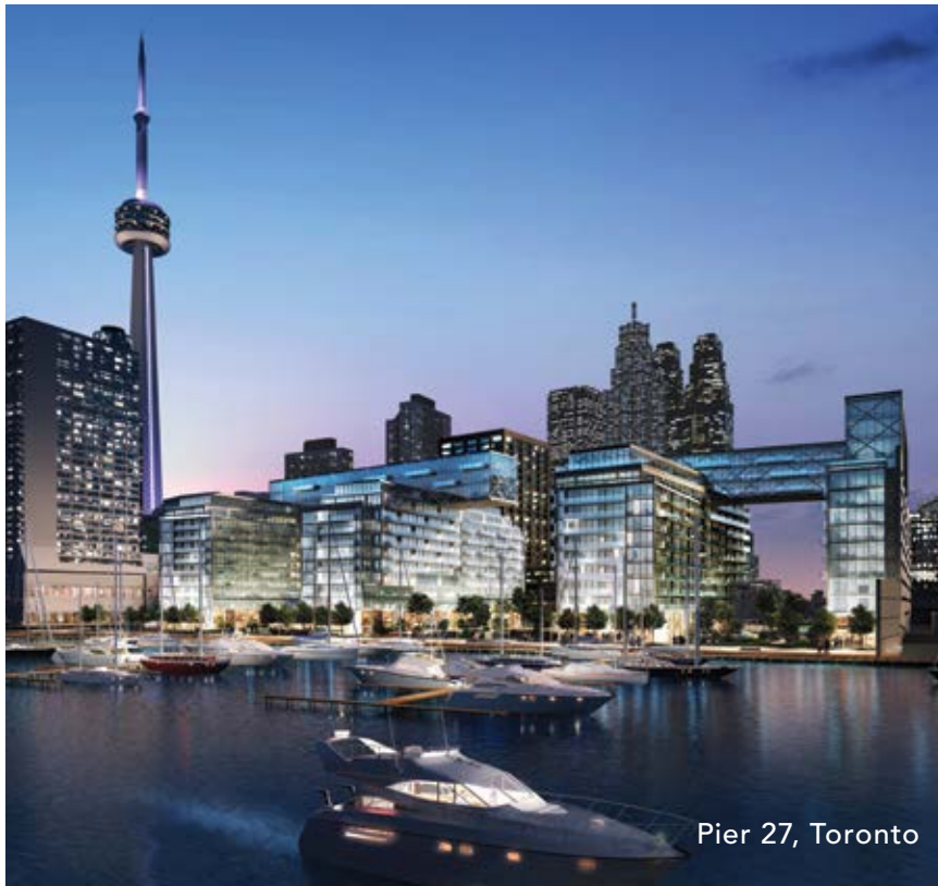
Pier 27, Toronto

Sabbia Beach will combine a spectacular location with luxurious amenities.