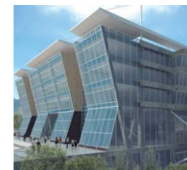
Torre Professional Valencia, Venezuela