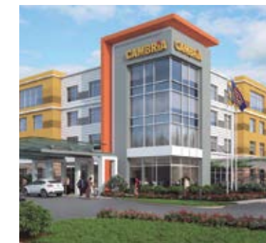
Cambria Houston, Texas